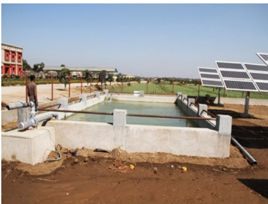
Fig. 1: The schematic of solar photovoltaic ground water pumping system

Since, water required to irrigate a cropped area depends upon the number of factors such as types of crop, crop growth cycle, type and condition of soil, land topography, application efficiency etc. This requires quantification of groundwater availability on daily basis as well as season wise. Further, the daily extracted volume of groundwater depends upon the