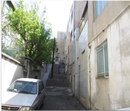
Fig. 2. Fereidunideadend in Omrani street

The high density of buildings and population in these areas, prepares a situation exacerbated by