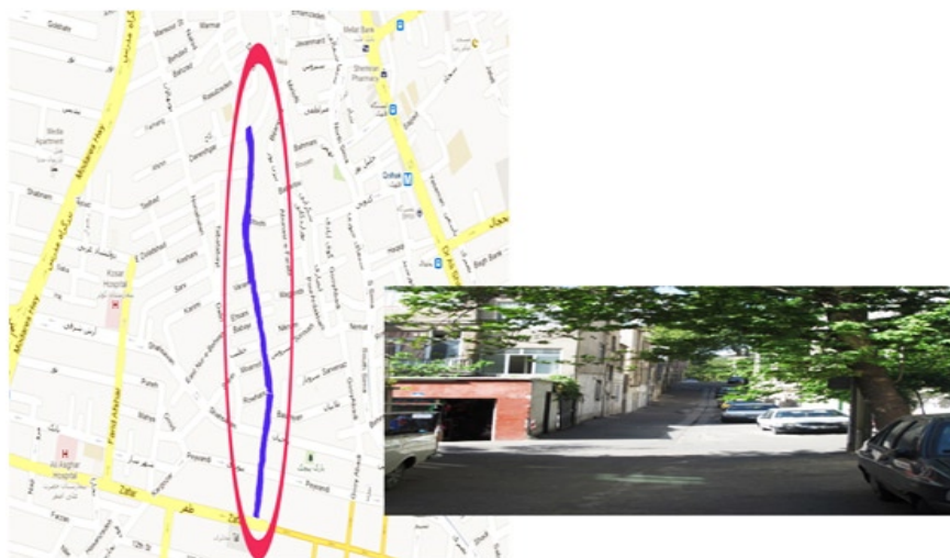
Fig. 3. Omrani Street as a heterogeneous spotsin northern Tehran

Immigrant population and low economic power persons, overflow crowd that are away of more exhaustive than desirable neighborhoods have been forced to choose to live in the old neighborhood because of low housing prices. In fact, such unsafe