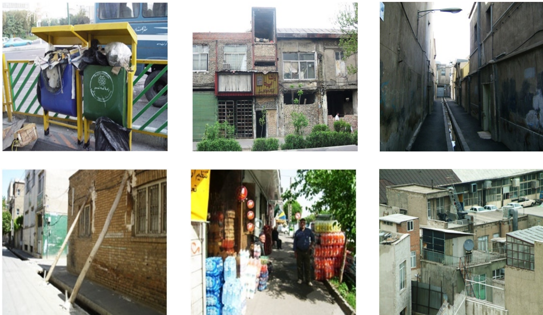
Fig. 3: One of Alley of Mokhtari street with minor width and high walls, old buildings with low autonomy and restoration

Today almost “all the experts arena believe on development of participation of group decision-making levels and adverse impacts, and determining effective strategies and policies. They emphasize on the role of citizen participation in decision-making. Accordingly, urban managers also plan to increase the probability factor, the legitimacy of a decision, and additional support their actions from the citizens, trying to find strategies and appropriate mechanisms to facilitate this work and examine.