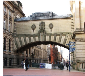
Fig. 4: Pedestrian way, in the context of the central and commercial center of Birmingham city, which is a shortcut way for accessing the central tissue.