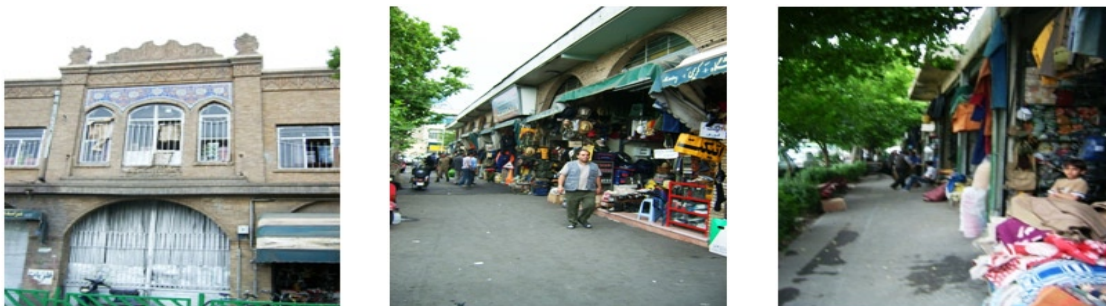
Fig. 2: Street view in area of 11 in Tehran