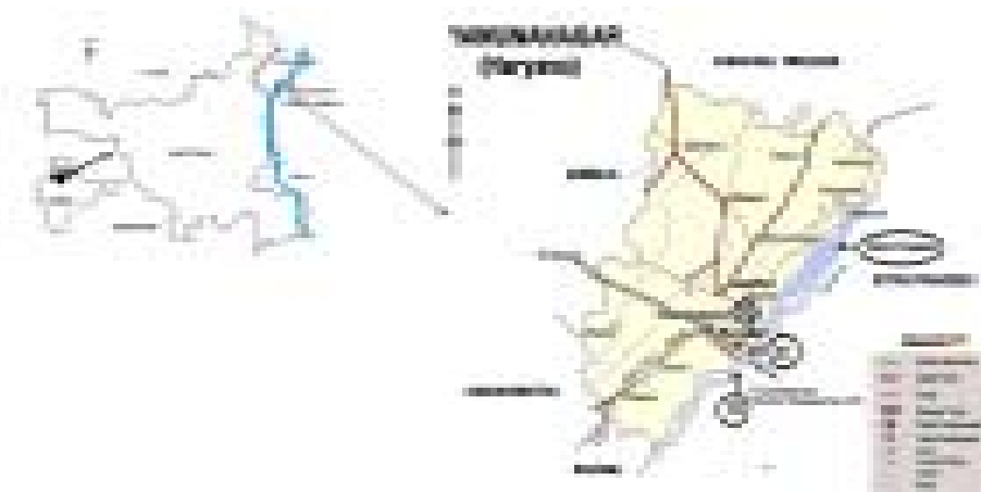
Fig. 1: Map of Haryana showing Yamuna river and district Yamunanagar with selected stations

were determined immediately, whereas for other physicochemical parameters i.e. soil alkalinity and chlorides, nitrate and organic matter, sediment was left to dry at air temperature and analysed according to standard procedures (Golterman et al. , 1978; APHA, 1998) within the following 3 to 4 days. pH and conductivity were analyzed using MultiSet F Line three Water analysis kit (E Merck). Alkalinity, chlorides and organic matter were analysed by titrimetric method. Nitrate was determined spectrophotometrically (APHA, 1998). Brian Oram's Water quality Index (WQI A) and Kaur's Water Quality Index (WQI B) was calculated by using parameters such as pH, DO, BOD, Turbidity, alkalinity, calcium, magnesium, sulphate, chloride and nitrate of collected water samples from selected sites as per the standard references of Oram (2007) and Kaur et al. (2001).