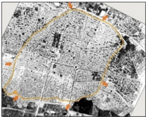
Fig. 1: Old Town with its six gates of fences, aerial photograph in 1335 8

Islamic civilization and culture, like other cultures and civilizations, from its inception, being influenced by the art of the Islamic culture. Therefore all Islamic arts, such as calligraphy, architecture,