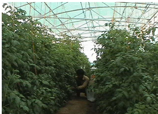
Fig. 2: Tomato in Arid Area Greenhouse at Kothara, Kutch, Gujarat

Night temperature in Kothara generally begins to drop below 18°C in December. January