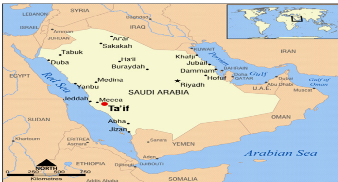
Fig. 1: Map of Ta'if showing locations and directions of sampling wells marked with red arrow

Analysis of variance (ANOVA) was applied to log-transformed data. Significant differences between means were tested by LSD (Statgraphics Statistical Package, Plus 5.1, Informer Technologies, Inc., USA).